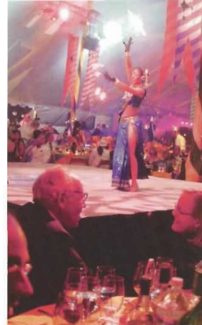
Annual Wine Auction